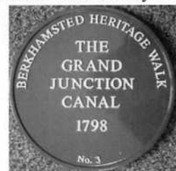
A typical plaque