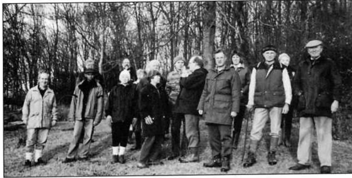
The walk back

18 members and friends and one dog took the New Year's Day walk to Aldbury, and 16 and a dog walked back too. Most of us had been up late the night before celebrating the New Millennium, including those who believe that it doesn't actually start for another year, and we set off in subdued mood. But even in mid-winter our surrounding countryside offers splendid walking that raises the spirits, particularly when the sun shines as it did for us. It was an excellent day.