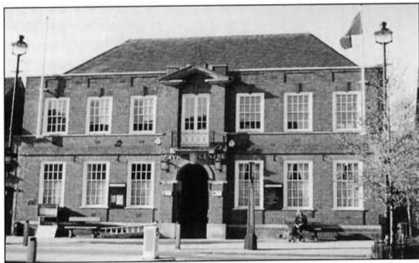
The Civic Centre: venue for musicals & jazz

Many of the groups cannot run at a profit for varying reasons, so subject to certain criteria and budget control their deficits are covered by grants from BAT. BAODS cannot put on, for example, 'Sound of Music' at a profit due to high startup costs and audience capacity limits of the Civic Centre, so the deficit is covered by BAT. The Graham Greene Birthplace Trust has grown successfully over three years and has been financially supported by BAT. Berkhamsted Jazz has been going longer and its gigs are now mostly a sellout but has its annual deficit