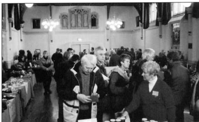
The Community Market