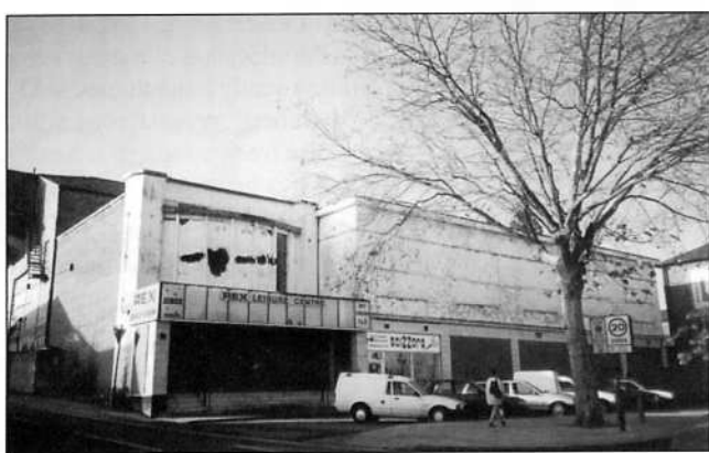
The Rex: two planning applications

We objected to the plan to double the size of the Halifax Bank sign in the High Street and the proposal to build three town houses in Church Lane between The Court House and Tescos. The lane is not suitable for any extra traffic and the development would further darken this historic area which has no street lighting.