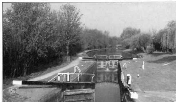
The towpath is now open to the public for all time

Over the first quarter of a century of its existence the Association joined in several important campaigns, not least of which was to preserve access to the canal towpath when the canal company in 1935 put up notices saying that unauthorised use of it was strictly forbidden. After much effort, eight years later the canal company signed a deed which gave the public for all time the privilege of using the towpath.