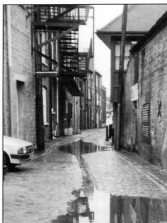
Church Lane: Not suitable for houses

We objected to the plan to double the size of the Halifax Bank sign in the High Street and the proposal to build three town houses in Church Lane between The Court House and Tescos. The lane is not suitable for any extra traffic and the development would further darken this historic area which has no street lighting.