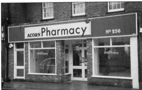
Another Environment Award candidate