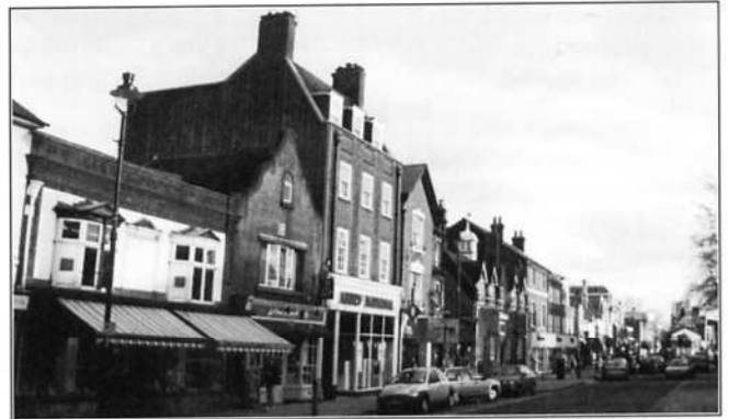
An Article 4 Direction needed?

Since the great flurry of activities reported in the last newsletter, apart from some notable exceptions it has been a quiet time on the planning front. Our attempts to get at least the central part of the High Street subject to an 'Article 4 Direction' have so far come to nothing, as Dacorum Borough Council Planning Department has continuing staffing difficulties; but it is still a long term aim of the Committee to get the extra level of protection we believe this planning restriction could give.