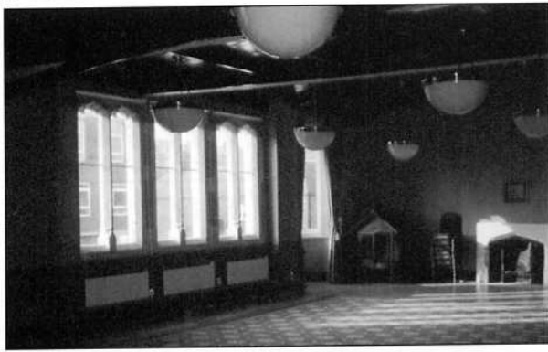
The Town Hall Clock Room

After the formal business of the AGM we shall as usual have one of the highlights of the Association's year - the Environment Award. The shortlist of nominations received for this from members is: