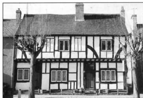
Dean Incent's House will have a plaque

It is by no means intended to be a complete guide to the town: rather its purpose is to give a flavour of our heritage to both local people and visitors to kindle greater interest in Berkhamsted's history. The leaflets will be provided free at various outlets in the town.