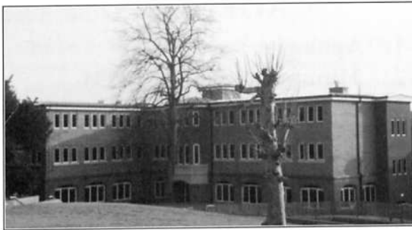
Berkhamsted Collegiate Preparatory School

Berkhamsted Collegiate Prep School New housing in Shootersway New house in Castle Hill Acorn Chemists' new premises in the High Street The refurbishment of the King's Arms New house at 23 Hall Park Conversion of 'Kiwi Corner', Gravel Path 2b & 2c Station Road - two town houses Housing development at Netherfield (Grantham Mews) The CARP works at Mill Street Town Hall - recent improvements: facade and Clock Room New houses in Covert Road, Northchurch