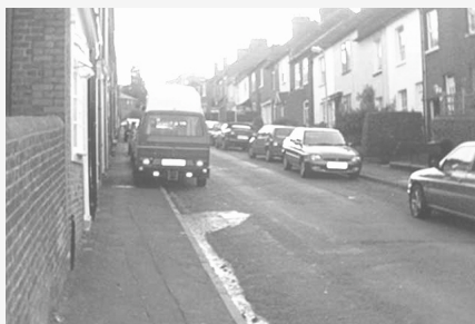
Examples of the 'problem' Victoria Rd (above) & George St (below)

A brief advert is for a joint litter pick on Monday 1 July at 7.15pm with the Berkhamsted Guides along the canal and we will all meet at the fake canal gates near the entrance to Waitrose