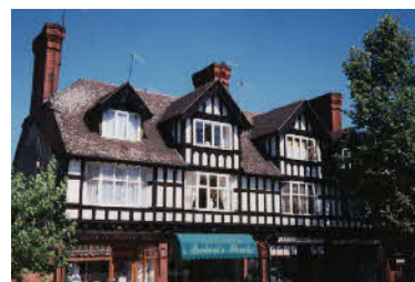
Mock Tudor shops in High Street