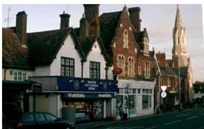
'Bobbys' previous signage

On planning matters we objected to the redevelopment of Bulbourne House in Gossoms End for 56 apartments as we felt it was overdense, lacked enough car parking and the access road to the rear should be on the Edgeworth House side. We also felt that a more innovative frontage should be a feature.