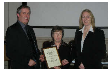
Some of the 2005 Environment Award winners