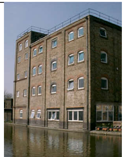
The Canal in Berkhamsted

The 'Totem pole' is on the list for a re-paint, The railings are due for a repaint and the mill has been redeveloped.