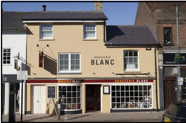
An improvement on Magoo's?